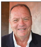
Paul McKenna – Cameron Mackintosh, Senator Fred Thompson + Others